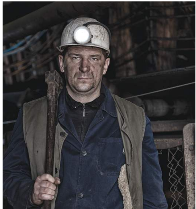
The national shift away from coal as a primary source of electricity has largely left coal miners and coal-fired power plant employees behind. Affordable solutions are available today to honor and support the people who have helped power the United States for generations, and to ensure that affected workers have the time and resources they need to adapt to the new national economy.

This analysis estimates the cost of providing a range of transitional support for coal miners and workers at coal-fired power plants who will likely lose their jobs before they reach age 65 (see Table 1, p. 4, and methodology section, p. 5). It focuses only on direct employment in coal mining and coal-fired power plants, but indirect jobs in the manufacturing and